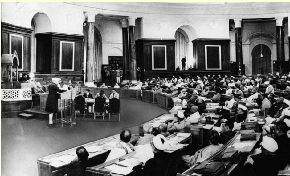
Picture above: Pt. Jawaharlal Nehru moves the resolution for an independent sovereign republic in the Constituent Assembly in New Delhi.

In the words of Durga Das Basu as stated in his book 'Introduction to the Constitution of India', "Constitution of India draws much of its source from Government of India Act, 1935. The Government of India Act, 1935 has provided the administrative details and language to the provisions of the Constitution".