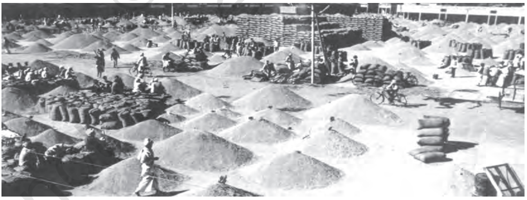
Fig. 5.1 Regulated market yards benefit farmers as well as consumers

Let us discuss four such measures that were initiated to improve the marketing aspect. The first step was regulation of markets to create orderly and transparent marketing conditions. By and large, this policy benefited farmers as well as consumers. However, there is still a need to develop about 27,000 rural periodic markets as regulated market places to realise the full potential of rural markets. Second component is provision of physical infrastructure facilities like roads, railways, warehouses, godowns, cold storages and processing units. The current infrastructure facilities are quite inadequate to meet the growing demand and need to be improved. Cooperative