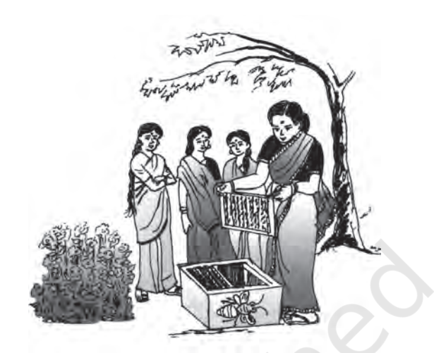
Fig. 5.5 Women in rural households take up beekeeping as an entrepreneurial activity

maintenance, hybrid seed production and tissue culture, propagation of fruits and flowers and food processing are highly remunerative employment options for women in rural areas.