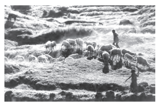
Fig. 5.3 Sheep rearing — an important income augmenting activity in rural areas

followed by others. Other animals which include camels, asses, horses, ponies and mules are in the lowest rung. India had about 303 million cattle, including 110 million buffaloes in 2019. Performance of the Indian dairy sector over the last three decades has been quite impressive. Milk production in the country has increased by about ten times between 1951-2016. This can be attributed mainly to the successful implementation of 'Operation Flood'. It is a system whereby all the farmers can pool their milk produced according to different grading (based on quality), processed and marketed to urban centres through cooperatives. In this system the farmers are assured of a fair price and income from the supply of milk to urban markets. As pointed out earlier Gujarat state is held as a success story in the efficient implementation of milk cooperatives which has been emulated by many states. Gujarat, Madhya Pradesh, Uttar Pradesh. Andhra Pradesh, Maharashtra, Punjab and Rajasthan, are major milk producing states. Meat, eggs, wool and other by- products are