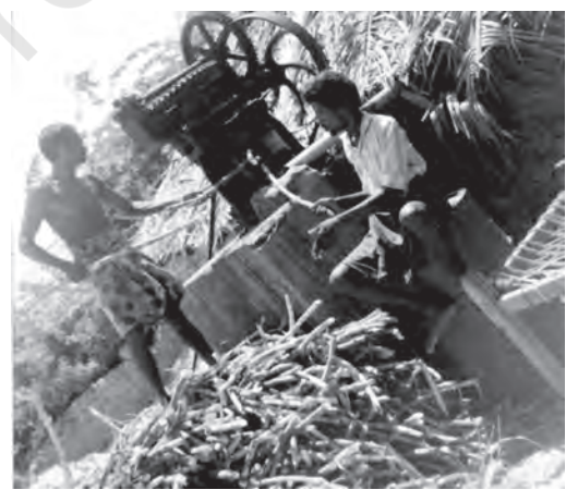
Fig. 5.2 Jaggery making is an allied activity of the farming sector

greater risk in depending exclusively on farming for livelihood. Diversification towards new areas is necessary not only to reduce the risk from agriculture sector but also to provide productive sustainable livelihood options to rural people. Much of the agricultural employment activities are concentrated in the Kharif season. But during the Rabi season, in areas where there are inadequate irrigation facilities, it becomes difficult to find gainful employment. Therefore expansion into other sectors is essential to provide supplementary gainful employment and in realising higher levels of income for rural people to overcome poverty and other tribulations. Hence, there is a need to focus on allied activities. non-farm employment and other emerging alternatives of livelihood, though there are many other options available for providing sustainable livelihoods in rural areas.