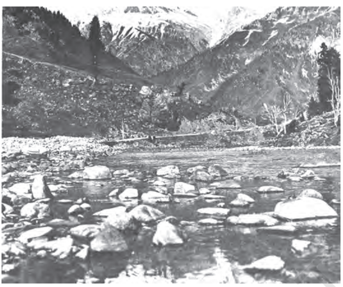
Fig. 7.1 Water bodies: small, snow-fed Himalayan streams are the few fresh-water sources that remain unpolluted.

functions is within its carrying capacity . This implies that the resource extraction is not above the rate of regeneration of the resource and the wastes generated are within the assimilating capacity of the environment. When this is not so, the environment fails to perform its third and vital function of life sustenance and