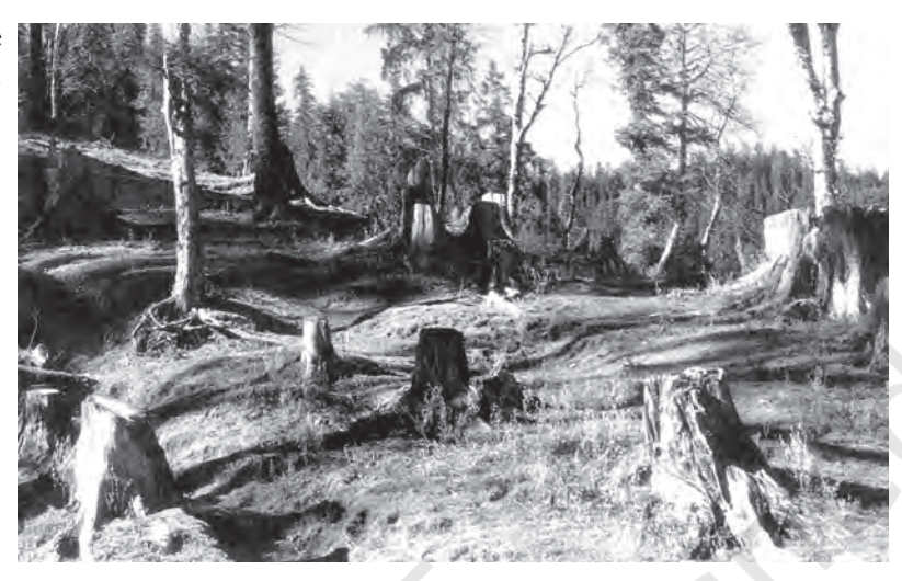
Fig. 7.3 Deforestation leads to land degradation, biodiversity loss and air pollution

deposits beneath the land surface, vast stretch of the Indian Ocean, ranges of mountains, etc. The black soil of the Deccan Plateau is particularly suitable for cultivation of cotton, leading to concentration of textile industries in this region. The Indo-Gangetic plains spread from the Arabian Sea to the Bay of Bengal — are one of the most fertile, intensively cultivated and densely populated regions in the world. India's forests, though unevenly distributed, provide green cover for a majority of its population and natural cover for its wildlife. Large deposits of iron-ore, coal and natural gas are found in the country. India accounts for nearly 8 per cent of the world's total iron-ore reserves. Bauxite, copper, chromate, diamonds, gold, lead, lignite, manganese, zinc, uranium, etc. are also available in different parts of the country. However, the developmental activities in India have resulted in