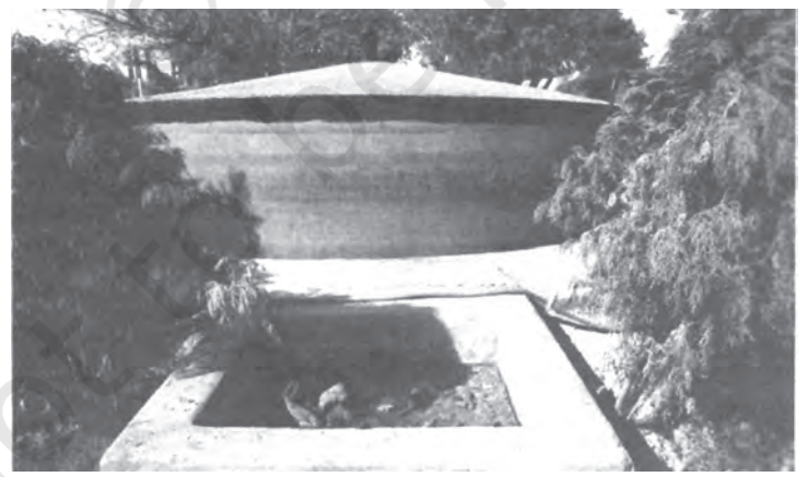
Fig.7.4 Gobar Gas Plant uses cattle dung to produce energy

Wind Power: In areas where speed of wind is usually high, wind mills can provide electricity without any adverse impact on the environment. Wind turbines move with the wind and electricity is generated. No doubt, the initial cost is high. But the benefits are such that the high cost gets easily absorbed.