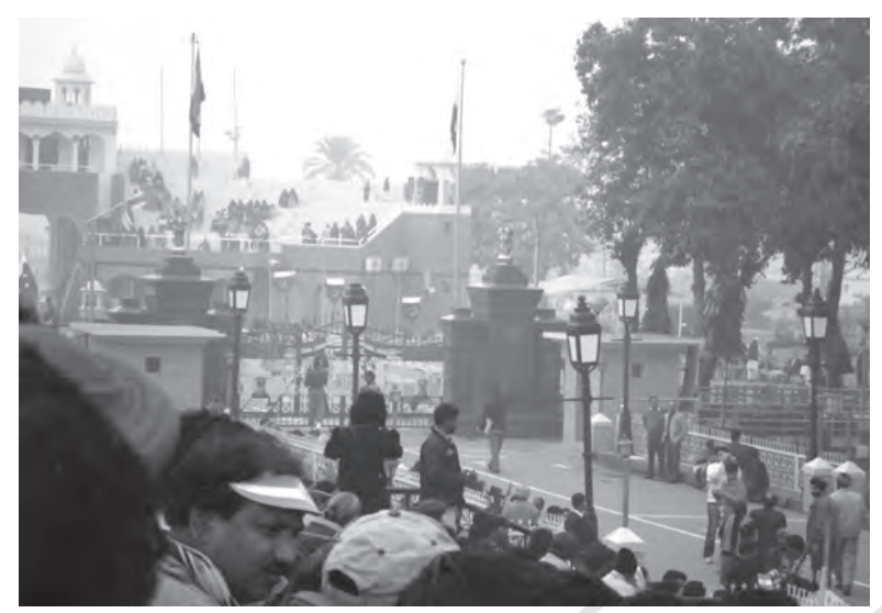
Fig. 8.1 Wagah Border is not only a tourist place but also used for trade between India and Pakistan

goods. At this stage, enterprises owned by government (known as State Owned Enterprises—SOEs), which we, in India, call public sector enterprises, were made to face competition. The reform process also involved dual pricing. This means fixing the prices in two ways; farmers and industrial units were required to buy and sell fixed quantities of inputs and outputs on the basis of prices fixed by the government and the rest were purchased and sold at market prices. Over the years, as production increased, the proportion of goods or inputs transacted in the market also increased. In order to attract foreign investors, special economic zones were set up.