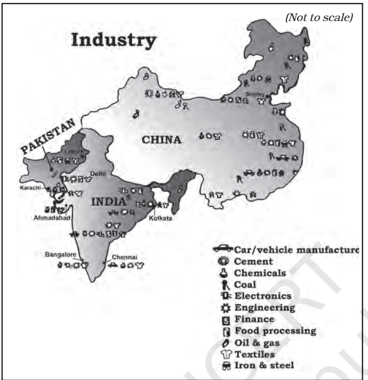
Fig. 8.3 Industry in India, China and Pakistan

and China's growth rates, whereas, India met with moderate increase in growth rates. Some scholars hold the reform processes introduced in Pakistan and political instability over a long period as reasons behind the declining growth rate in Pakistan. We will study in a later section which sector contributed to different growth rates in these countries.