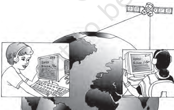
Fig. 3.1 Outsourcing: a new employment opportunity in big cities

global trade organisation to administer all multilateral trade agreements by providing equal opportunities to all countries in the international market for trading purposes. WTO is expected to establish a rule-based trading regime in which nations cannot place arbitrary restrictions on trade. In addition, its purpose is also to enlarge