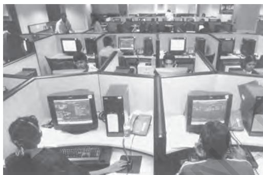
Fig. 3.2 IT industry is seen as a major contributor to India's exports

Some scholars question the usefulness of India being a member of the WTO as a major volume of international trade occurs among the developed nations. They also say that while developed countries file complaints over agricultural subsidies given in their countries, developing countries feel cheated as they are forced to open their markets for developed countries but are not allowed access to the markets of developed countries. What do you think?